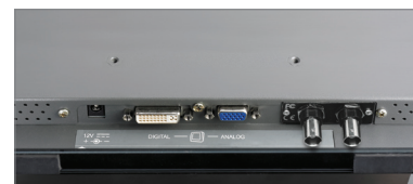
Looping BNC video connector for multiple display connections