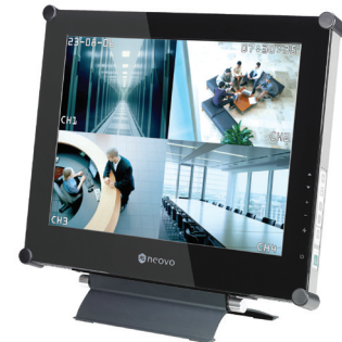
Specifically designed and tested for commercial video security applications