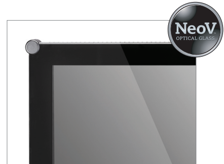
NeoV™ Optical Glass for hard glass protection and strong metal casing for secure mounting